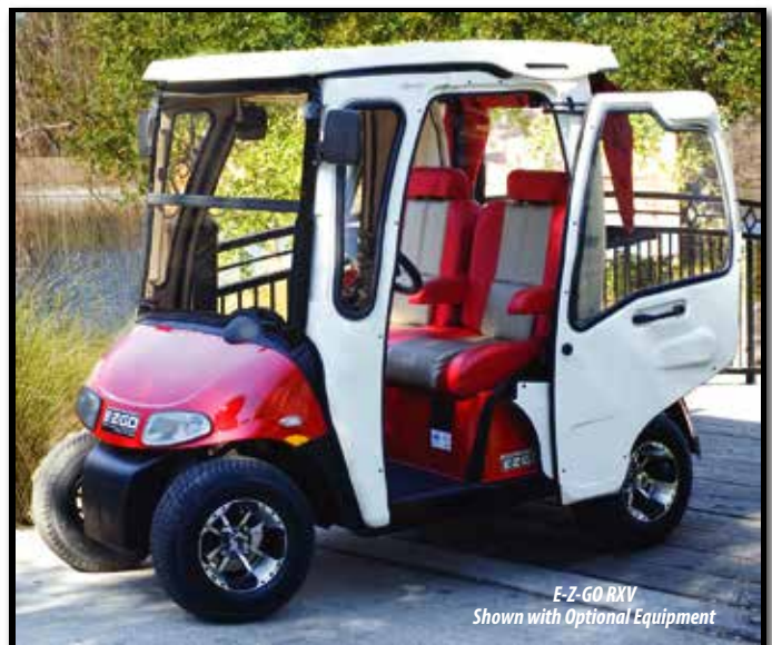
E-Z-GO RXV Shown with Optional Equipment

70 Hartwell Street | West Boylston, MA | 01583 | 508-853-2200 | www.CurtisCab.com