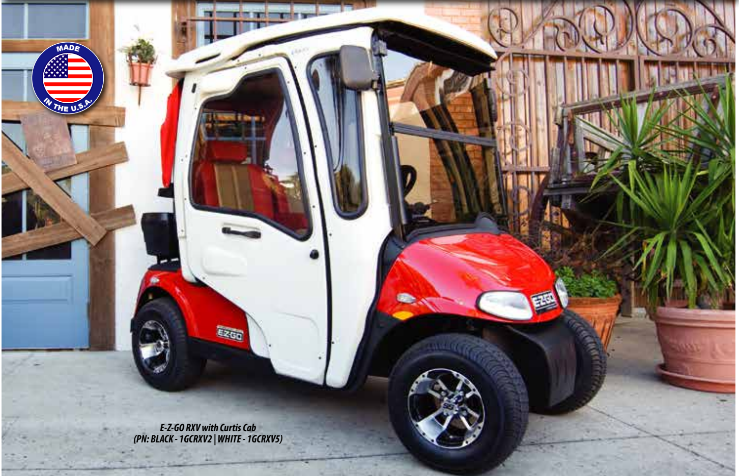
E-Z-GO RXV with Curtis Cab (PN: BLACK - 1GCRXV2 | WHITE - 1GCRXV5)