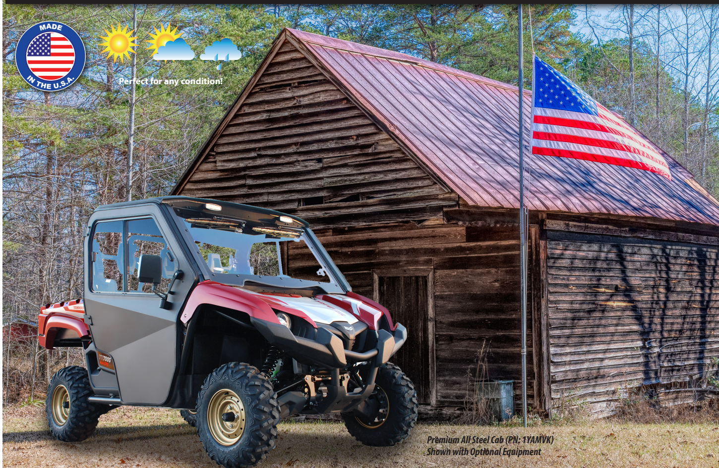
Premium All Steel Cab (PN: 1YAMVK) Shown with Optional Equipment