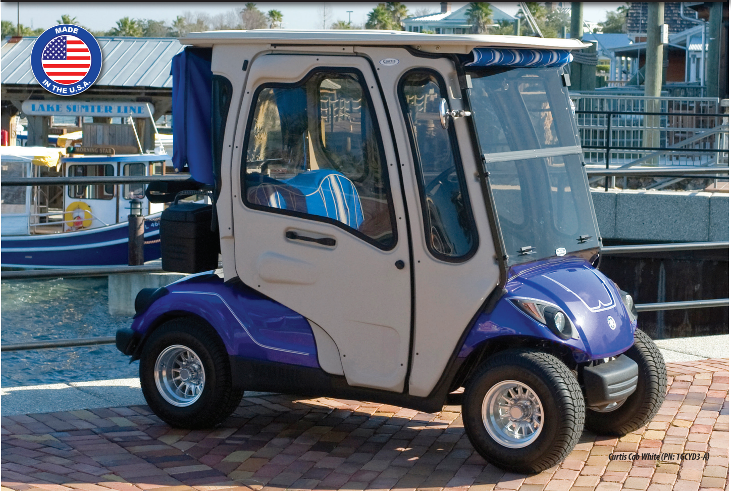
Curtis Cab White (PN: T6CYD3-A)

Comfort and Style on the Golf Course or Anywhere You Travel