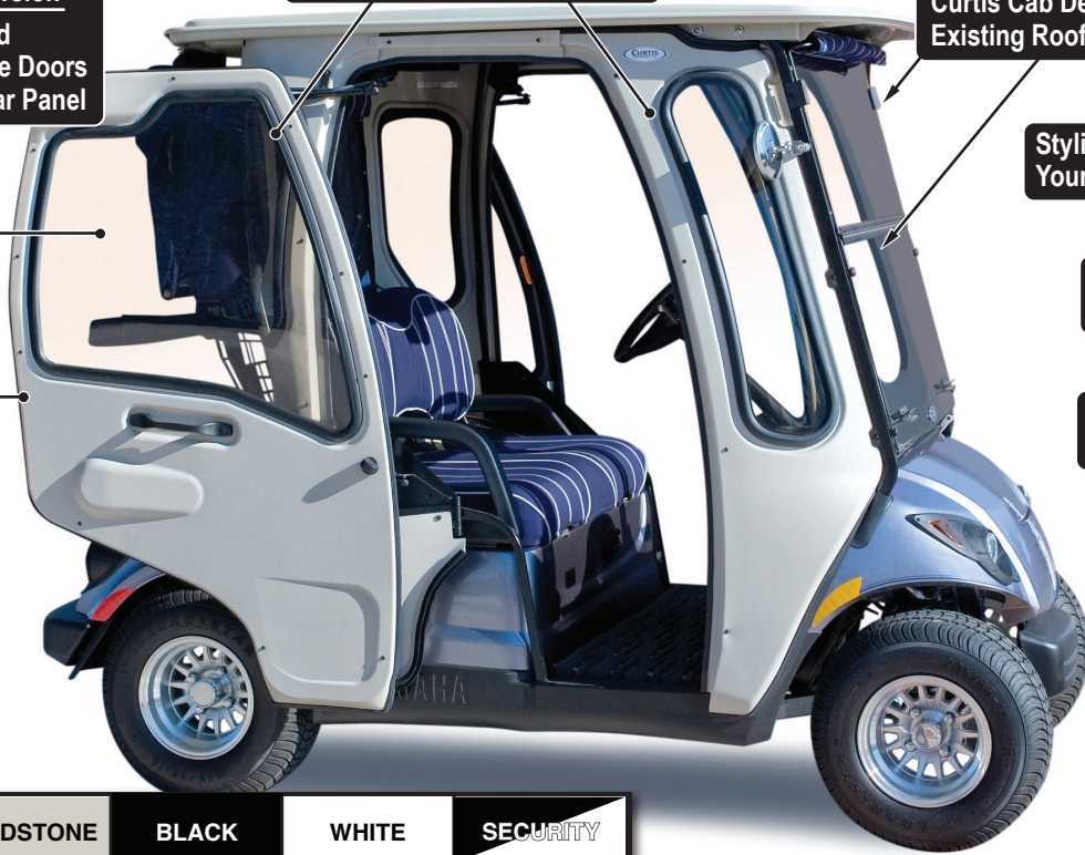
Yamaha Drive 2