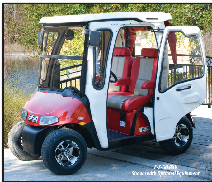
E-Z-GO RXV Shown with Optional Equipment

70 Hartwell Street | West Boylston, MA | 01583 | 508-853-2200 | www.CurtisCab.com