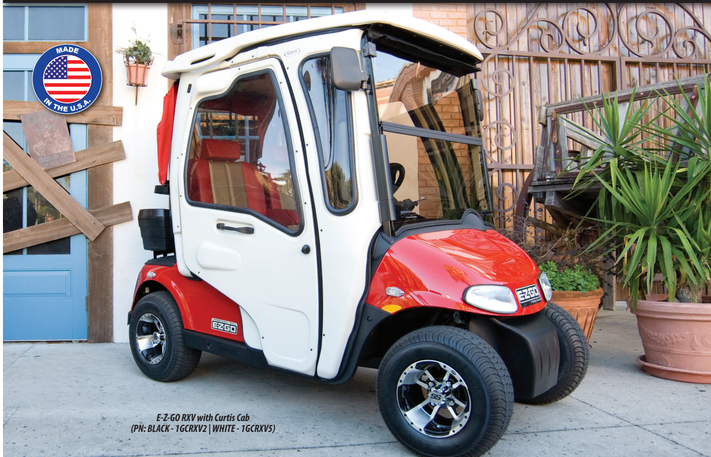
E-Z-GO RXV with Curtis Cab (PN: BLACK - 1GCRXV2 | WHITE - 1GCRXV5)

Cab Fits Gas or Electric Vehicles thru June of 2022