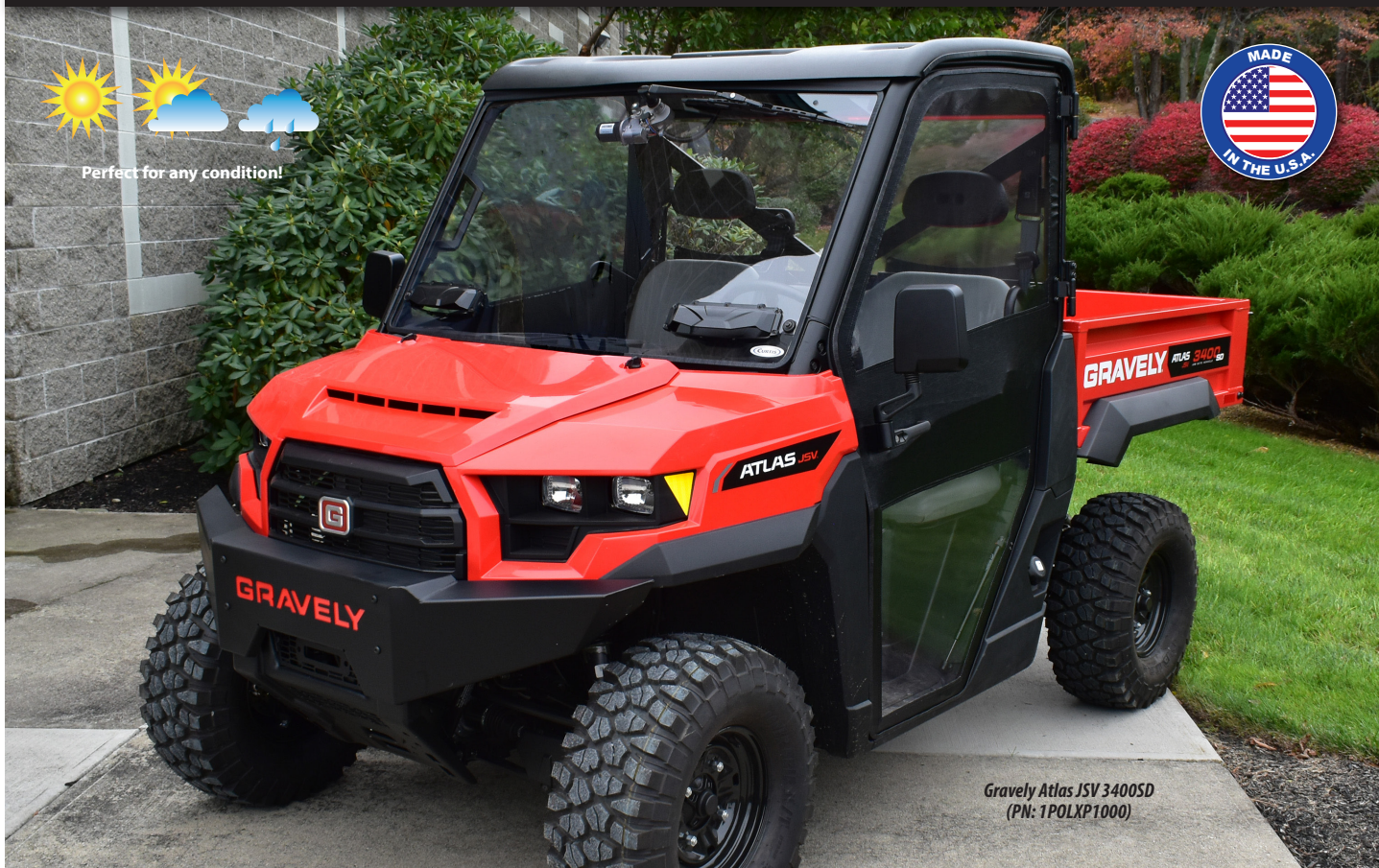
Gravelly Atlas JSV 3400SD (PN: 1POLXP1000)

Fits Gravelly Atlas JSV 3200, 3400, & 3400SD