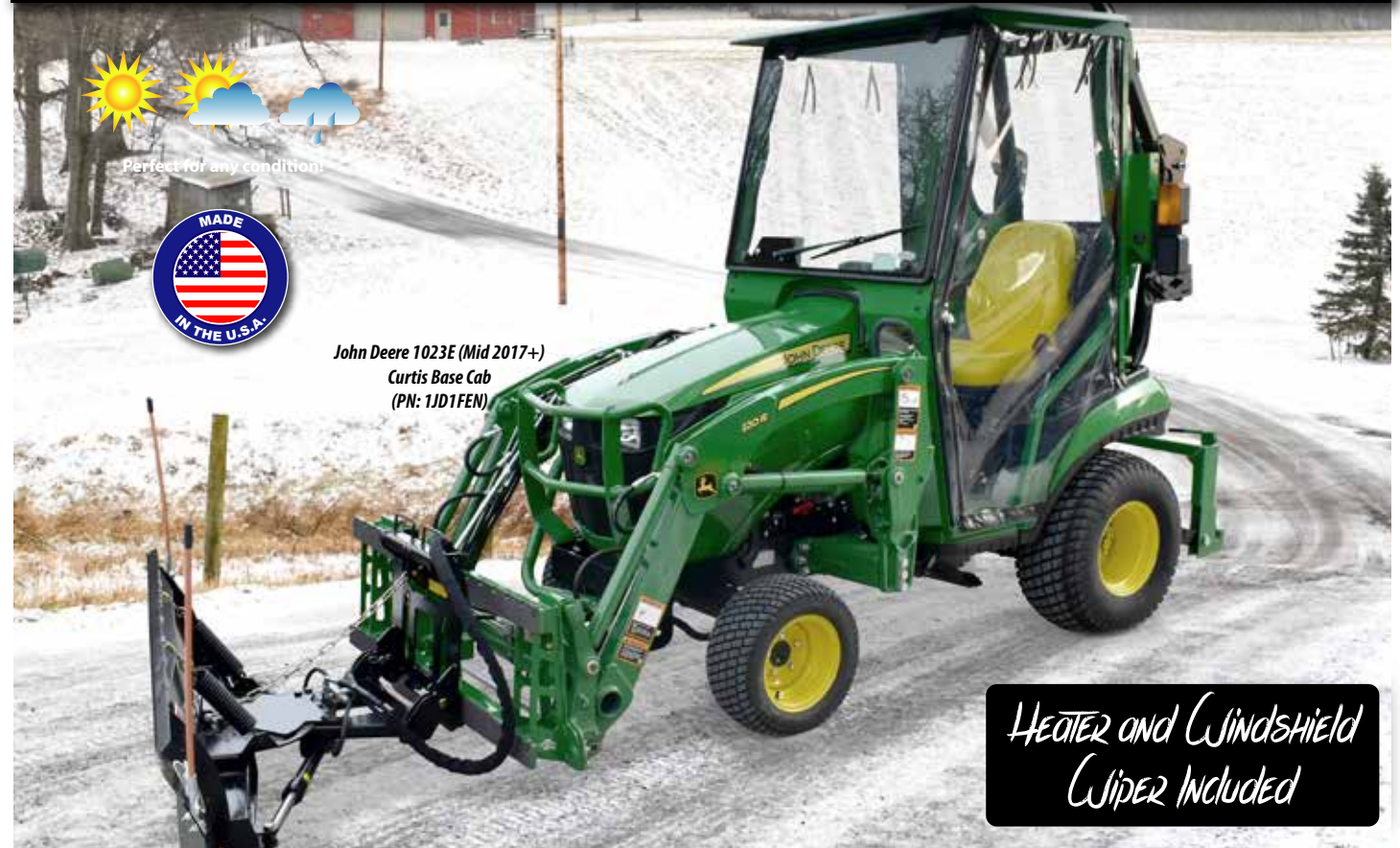
Fits John Deere 1023E & 1025R (mid-2017+ ROPS model years)