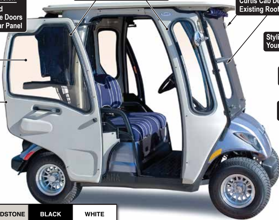
Yamaha Drive 2