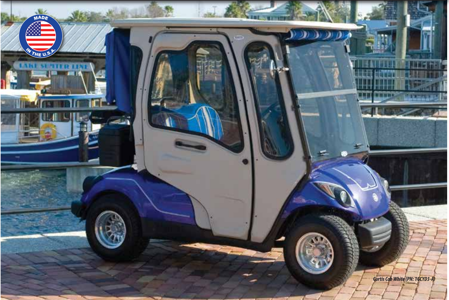
Curtis Cab White (PN: 16CYD3-A)

Comfort and Style on the Golf Course or Anywhere You Travel